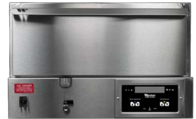
HBB0D1 CVAP HOLD/SERVE DRAWER FANLESS (SHOWN)