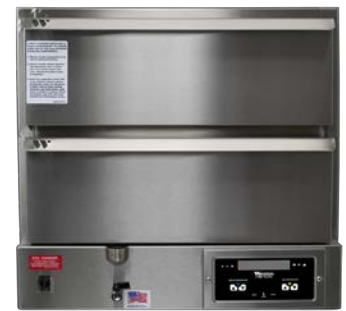
HBB0D2 CVAP HOLD/SERVE DRAWER TWO DRAWER MODEL FANLESS(SHOWN)