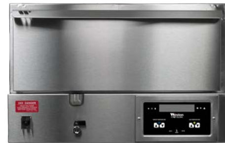
HBB5D1 CVAP HOLD/SERVE DRAWER ONE DRAWER MODEL WITH FAN (SHOWN)