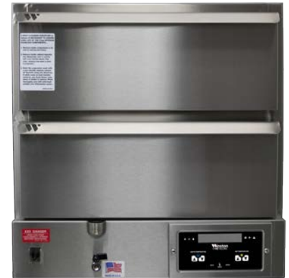
HBB5D2 CVAP HOLD/SERVE DRAWERS TWO DRAWER MODEL WITH FAN (SHOWN)