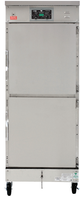
HL4522-SS CVAP HOLDING CABINET Electronic Differential Control

FULL SIZE MODEL, WITH FAN, STAINLESS STEEL (SHOWN)